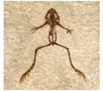
See Fossils on page 2

On a visit to the Grand Canyon, you will find displays indicating that the layers mostly formed in shallow seas or along coastlines of the sea. The reason is because 95%