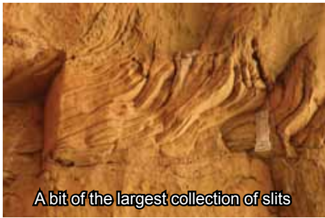
A bit of the largest collection of slits