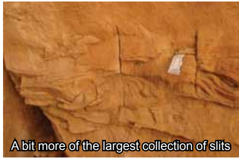
A bit more of the largest collection of slits

This collection of slits is at about the vertical middle of the Coconino Formation. (Most of the Coconino folds we discussed two issues ago were near the vertical bottom of the Coconino.) You will notice in the left photo that the strata is folded in a manner similar to the other Coconino folds. But a couple of the folds look more like earthquake-caused folds. So, the slits may have formed during deposition or they may be the result of the great Sedona earthquake we described last issue, or both.