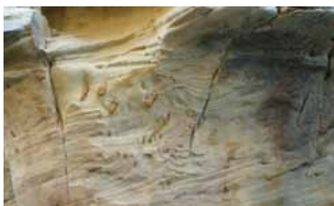
Possible Slits in Pumhouse Wash (in the Coconino). Note that the slits are in distorted strata

As we started this series nearly a year ago, I was looking through my photographs and remembered that there are many more places with these vertical water escape slits. Here are a few: