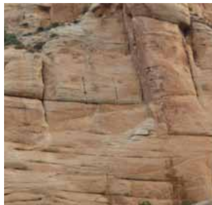
Fay Canyon Overlook - location of a large area of earthquake distortion shown in last issue.