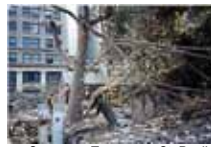
Sycamore Tree saves St. Paul's

was unharmed. One piece of steel from the towers fell on the grounds but the sycamore tree that our founders prayed under prevented the piece from hitting the chapel. But, the sycamore