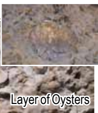
Layer of Oysters

this to that: 95% of the fossil creatures found in the same layer as dinosaurs are marine creatures!