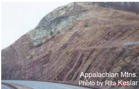
Appalachian Mtns.

The photo on page 1 shows an excellent example of such a bend (see the people in the photo for scale). Notice how the rock curves from horizontal to vertical. Either the rock on the left side of the fault moved down or the right side moved up or both. The logical explanation is that the strata was fluidized when the faulting occurred. Because the rock was fluidized, it did not break or crack as the bending occurred. "Fluidized" is a condition where the rock is not just damp or wet, but it is water saturated like mud that flows down a hillside. There are many examples of entire mountains being bent. Here are two: