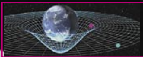
Gravity Well caused by earth

We must now take a bit of a rabbit trail so you understand exactly what happens. Einstein's theory of relativity is foundational to most cosmologies, including the big bang and the WHC. We will not deal with relativity in depth, but just one aspect of relativity. The concept is called a gravity well.